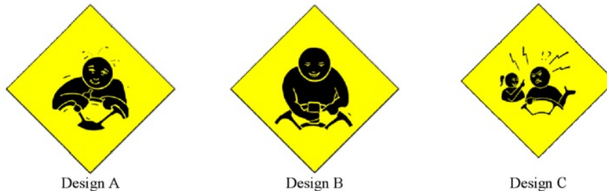
Figure 1. Traffic signs design from the emoticon symbol

passenger, lost concentrate, lost control and emotion. Driver too focus on the dialogue with other passenger and has no awareness for the danger that he probably cause either toward himself or others.