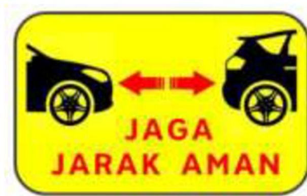
Figure 1: The Design of Safety Message

The traffic sign or safety driving message directed to all drivers used in this experiment design with a writing of "KEEP SAFETY DISTANCE" (JAGA JARAK AMAN) installed at the rear of the experimental car, with the dimension equals to (46 x 69) cm, font size equals to 5 cm and font type used is clearview as Figure 1 shows.